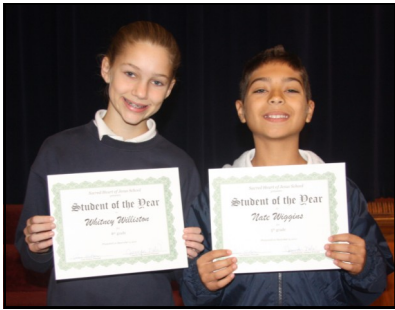
Students of the Year