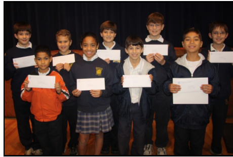
Fifth grade TIP