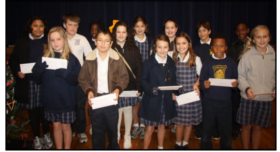
Fourth grade TIP